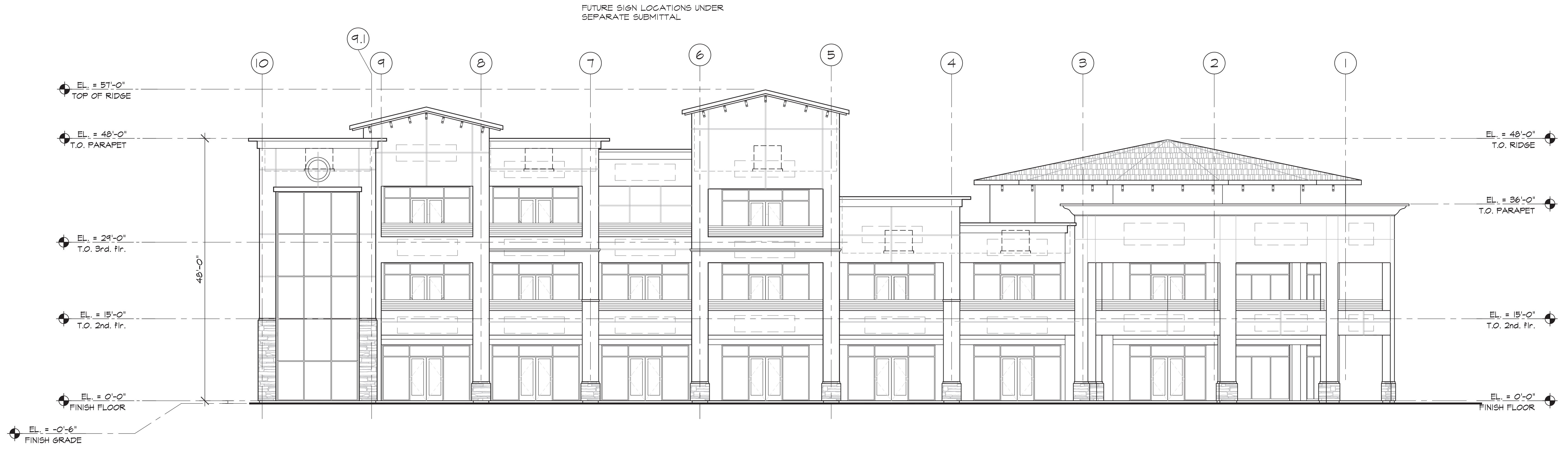
1 NORTH ELEVATION (FRONT) A6.01 1/8"=1'-0"