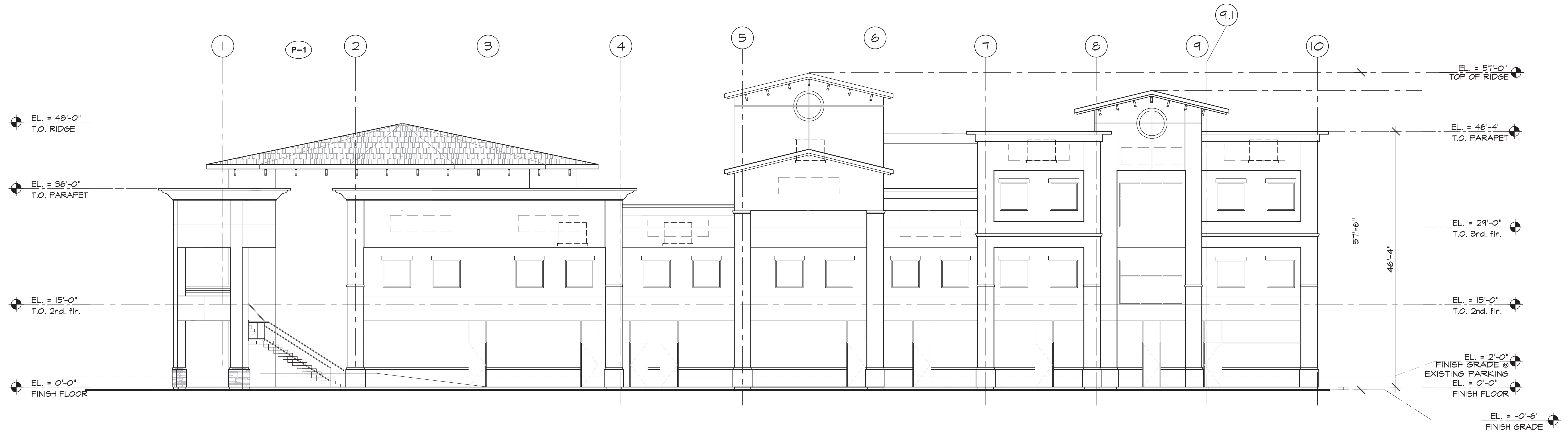
1 SOUTH ELEVATION (REAR) A6.02 1/8"=1'-0"